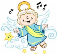
Advent/Christmas is coming

It's time to gear up for Advent/Christmas . Hopefully you kept your Resource Booklet from last year to help you decide on the resources you need. Below are a few new resources that have been added since last year. Remember you can stop by to visit the Resource Center, call us OR go to www.kiskipby.org and search for resources on our webpage.