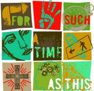
PRESBYTERIAN YOUTH TRIENNIUM 2010